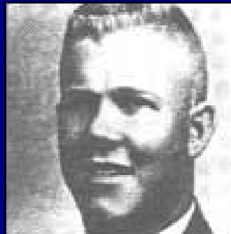
College photo of Charles Whitman (University of Texas)